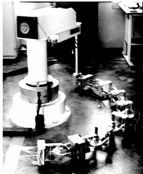
View of our Snake robot