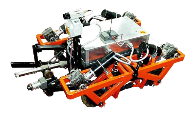
Figure 2 shows the mobile robot testbed.

Address: Suksawasd 48 Bangmod Bangkok 10140 Thailand Tel. No. +66 (0) 2470-9691, 9339 Fax +66 (0) 2470-9691 http://fibo.kmutt.ac.th